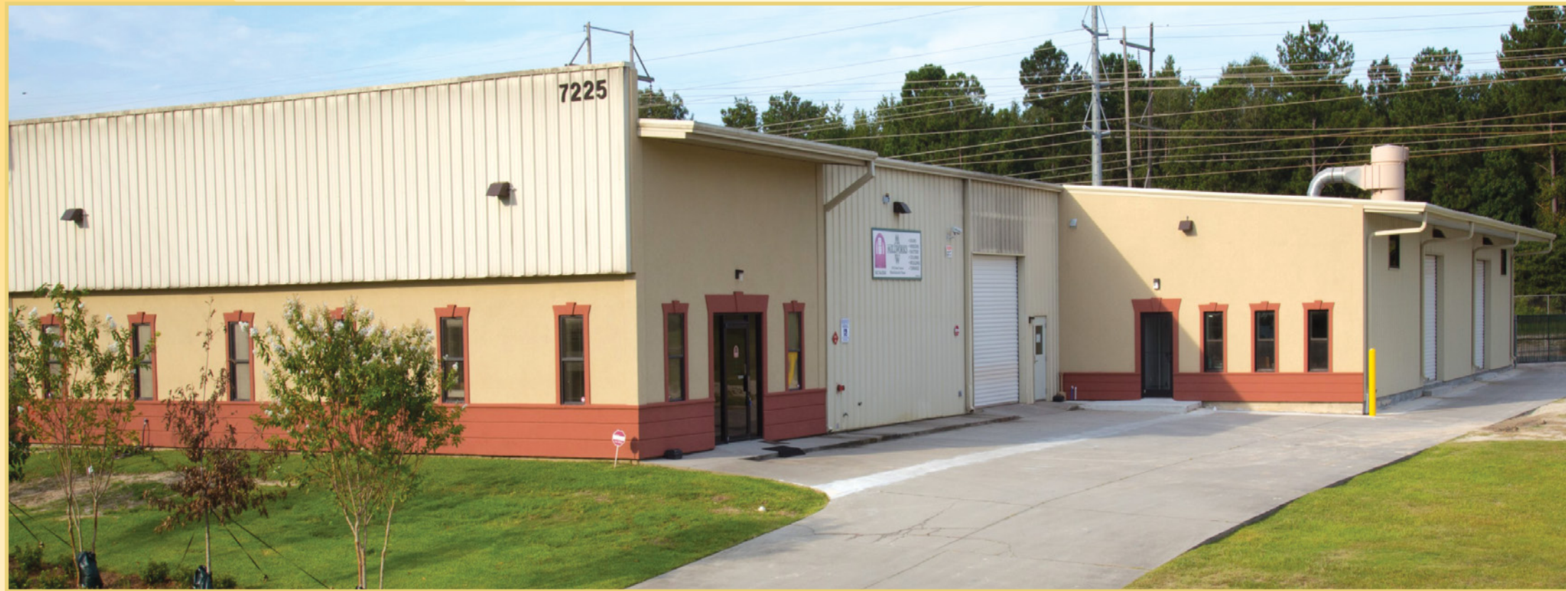
7225 PEPPERMILL PARKWAY • NORTH CHARLESTON, SC 29418

Welcome to MW Millworks; locally owned and operated. We are manufacturers of high quality windows, doors, shutters, turnings and a wide range of custom millwork. With a dedication to historic preservation and restoration, we have taken pride in serving downtown Charleston and surrounding areas for the past 29 years.